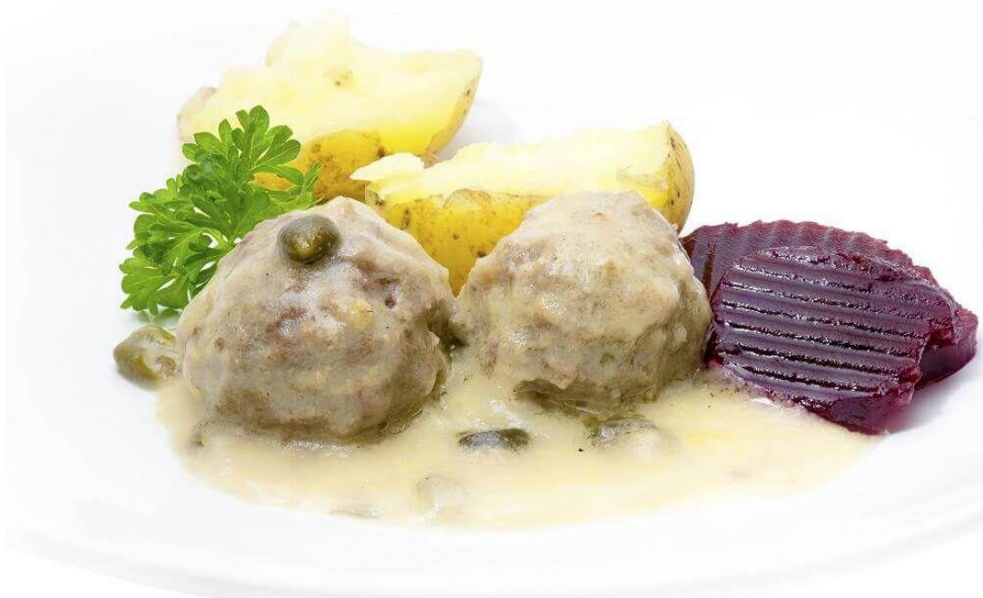
Figure 1. Serving option for Königsberg klops

helping to offset the buttery sauce, preserving the texture of the dish; Cabbage stewed with apples to add a touch of sweetness and tartness to the dish; Fresh green beans, lightly salted and seasoned with olive oil to accentuate the natural flavors of the meat and sauce; Buckwheat – a popular side dish used with many meat dishes. A modern twist on this dish is served with boiled vegetables (beets, carrots) or baked vegetables (zucchini, eggplant, or pumpkin), or pickled cucumbers or tomatoes, which impart a subtle sweet and tangy flavor. The classic recipe and preparation technology for Königsberg klops have evolved, resulting in a diverse range of klops dishes prepared at home or in catering establishments (Fig. 1). As diversity has grown, so has intercultural interaction, making travel to discover new exotic flavors attractive to food lovers. Technological advances and innovations in gastronomy have contributed to the development of gastronomy and paved the way for the creation of new culinary trends.