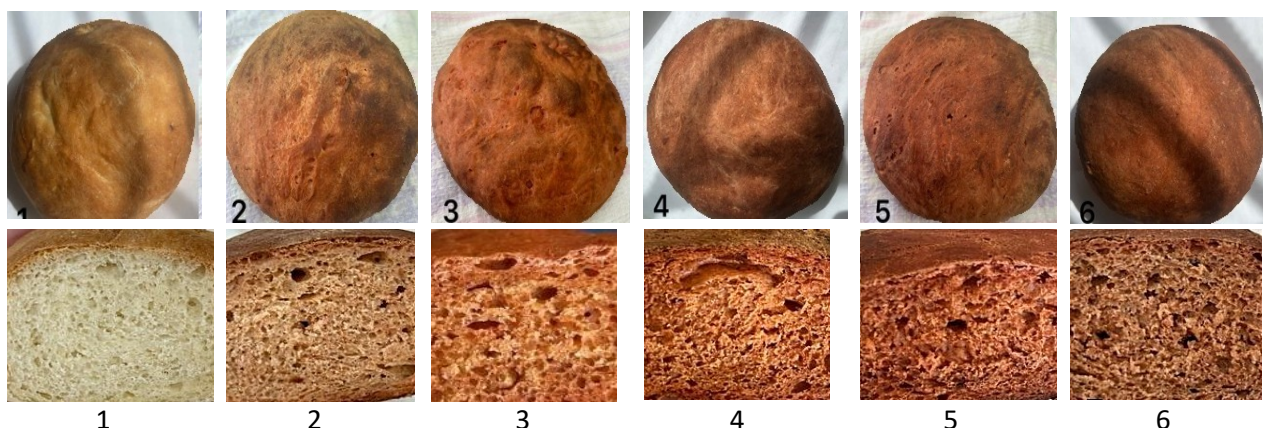
Figure 3. Appearance of products according to the first research option: 1 – control; 2-6 – 3-11% bet powder

baked, the crumb was not sticky, had developed and uniform porosity, a slight roughness was observed on the surface with an increase in the amount of root crop powder to 7-11% of the flour weight (Figure 3).