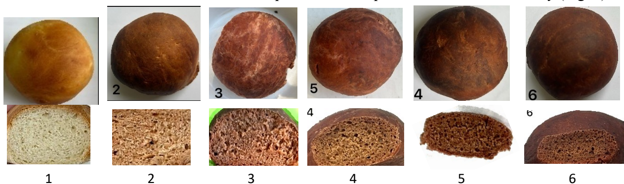
Figure 4. External appearance and cross-sectional view of products obtained using the low temperature fermentation method: 1 – control; 2-6 – 3-11% beet powder

In terms of organoleptic characteristics, the samples of the second variant of the study were slightly inferior to the products of the previous experiment with the same dosages of powder in the recipe. It was noted that when the additive in the system was increased to 9 and 11%, the porosity was uneven and finer, there were bursts, but the crumb was not sticky. In terms of taste and smell, the buns did not differ from the products of the previous variant of the study (Fig. 4).