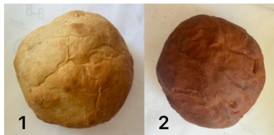
Figure 5. Samples of bread sticks: 1 – control sample; 2 – experimental sample with the addition of 7% powder

In terms of external indicators, the dough without adding sugar rose worse and had a rough surface. The finished products had uneven and fine porosity, a rough surface, and an indistinct taste and smell. In this regard, the quality indicators were not further assessed.