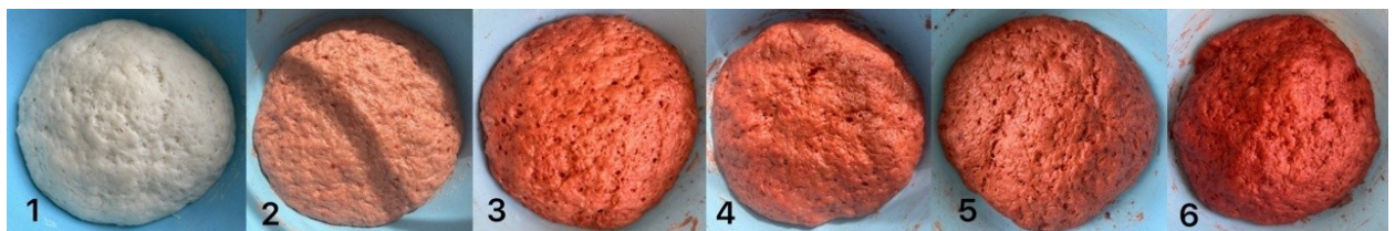
Figure 2. Appearance of experimental test variants: 1 – control; 2-6 – 3-11% beet powder

When analyzing the quality indicators of the first fermentation variant of the dough, we noted the difference between the experimental systems and the control only in color and smell; the structure and plasticity did not change (Figure 2).